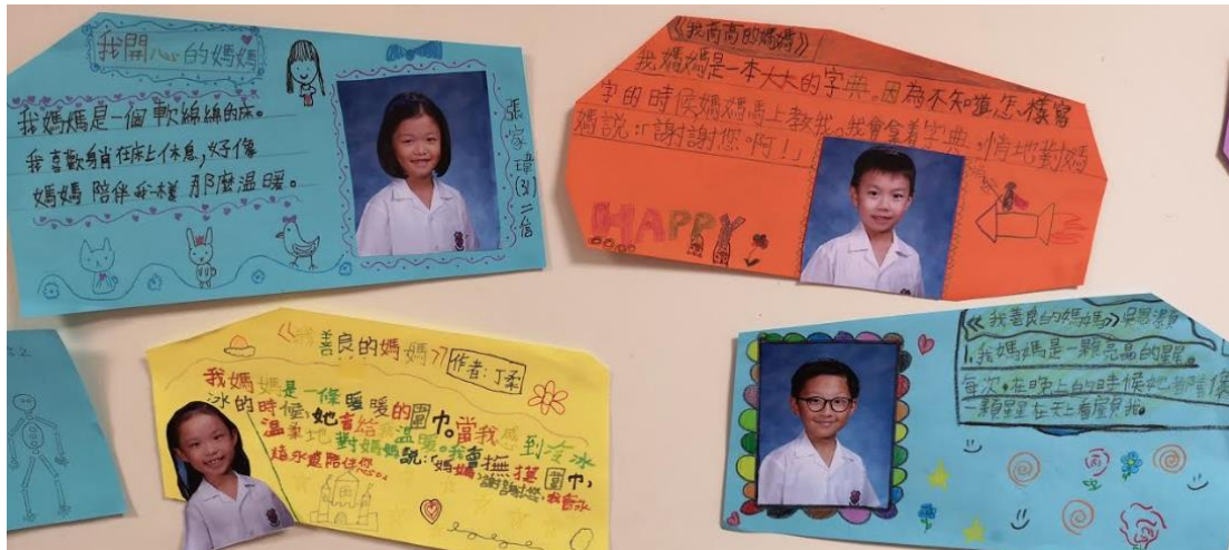
Parents in our students' eyes

I am glad that our students are able to show their gratitude to parents through touching words in a recent P.2 creative writing task. Wish you all a joyful Mother's Day and Father's Day with your beloved ones with tonnes of blessing from our Lord.